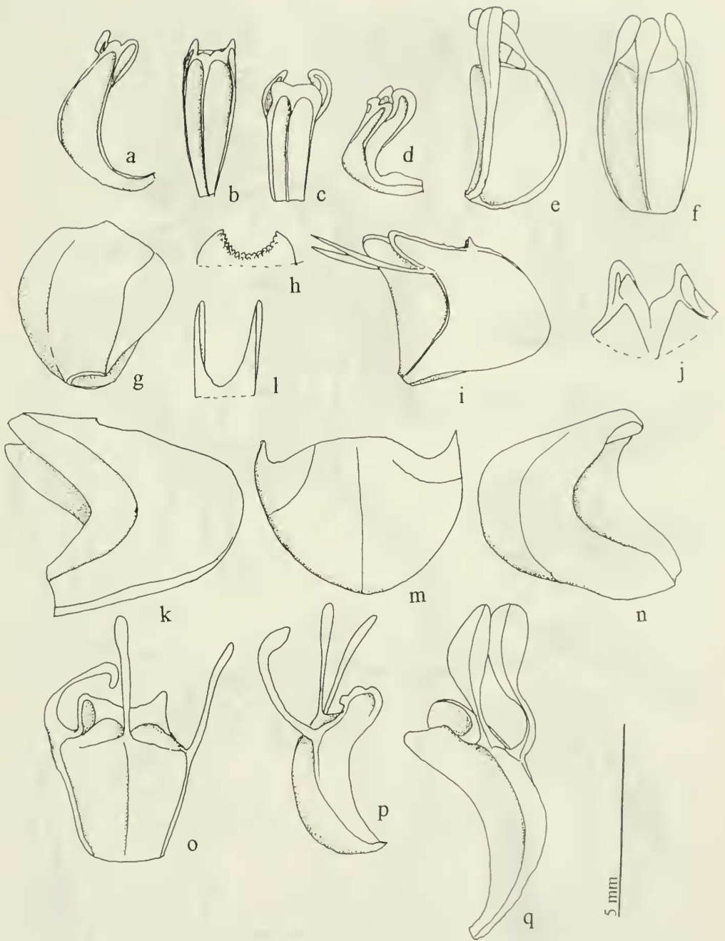
Fig. 1: Floral scales in Cajophora : C. cernua (Sleumer 2440): a lateral, b dorsal. C. stenocarpa (Tovar 147): c dorsal, d lateral. C. lateritia , cult at M: e lateral, f dorsal. C. cirsiifolia (Smith 1190): g lateral, h apex. C. dumetorum (Ehrich 435): i lateral, j apex. C. carduiifolia (Sandeman 191): k lateral, l apex. C. pentlandii , cult at BR 1828: m apical view, n lateral. C. pterosperma (Woytkowski 6676): o dorsal, p lateral. C. aconquijae (Sleumer 2440): q lateral.